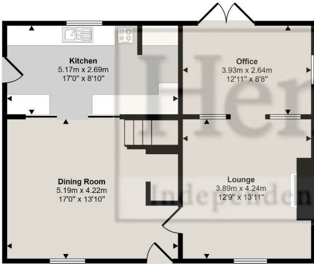
Ground Floor Approx 65 sq m / 701 sq ft

Approx Gross Internal Area 129 sq m / 1392 sq ft